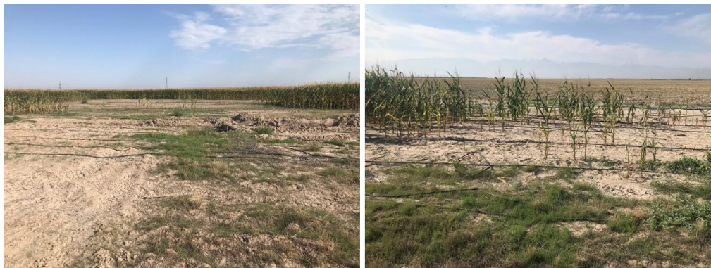
Figure 2. Condition of corn plants on the spotted soda-saline solonchic of the experimental plot

solonchic types, with chloride-soda and soda-sulfate chemistry covering an expanse of 77 hectares. Notably, heavy loamy medium-salt semi-hydromorphic solonchics, comprising approximately 10% (8 hectares) of the field, occur in the form of spots on microdepressions, displaying sulfate-soda, soda-sulfate, and pure soda chemistry. Solonchics are marked by a dense clay horizon B, rich in adsorbed (exchangeable) Na + and occasionally Mg 2+ . These soils also contain free soda (Na 2 CO 3 ), contributing to a highly alkaline environment, which adversely affects corn growth, leading to sparse or complete absence in affected areas.