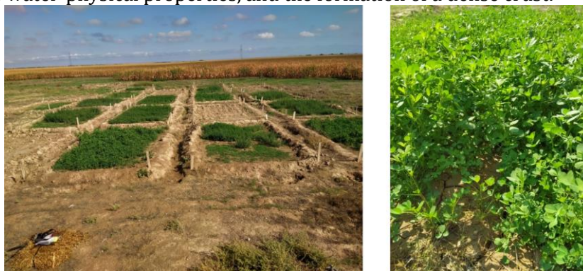
Figure 3. Overview of the experimental plot and the alfalfa cultivated within

The study aimed to assess the impact of incubation and leaching of reclaimed soils with phosphogypsum, elemental sulfur, and sulfuric acid on perennial grass yield (Figure 3). Alfalfa variety "Kokorai" was sowed in the spring at a seeding rate of 26 kg/ha. Variants treated with phosphogypsum and sulfur showed relatively good alfalfa green mass yield, crucial considering the challenge of obtaining a harvest on the soda-saline solonchets of the experimental plot without ameliorants. The zero yield in the control variant underscored the necessity of ameliorants. The impediments to alfalfa seed germination included toxic soda and sulfates in the soil solution, adverse water-physical properties, and the formation of a dense crust.